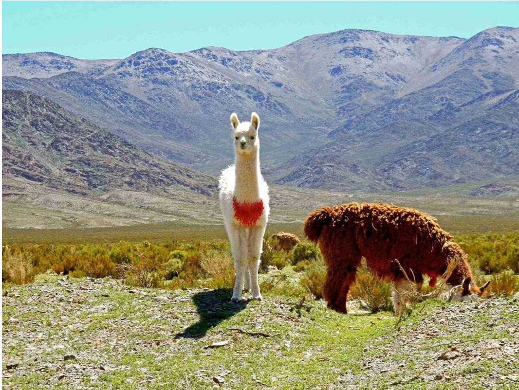
Alpacas in the Andean highlands of Argentina