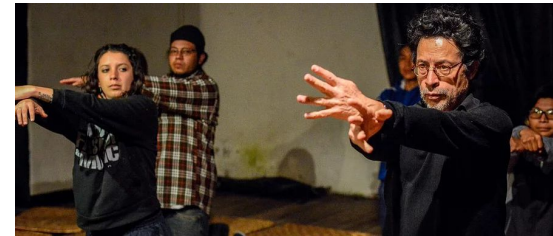
Pachaysana, Rehearsing Change study abroad program, Ecuador