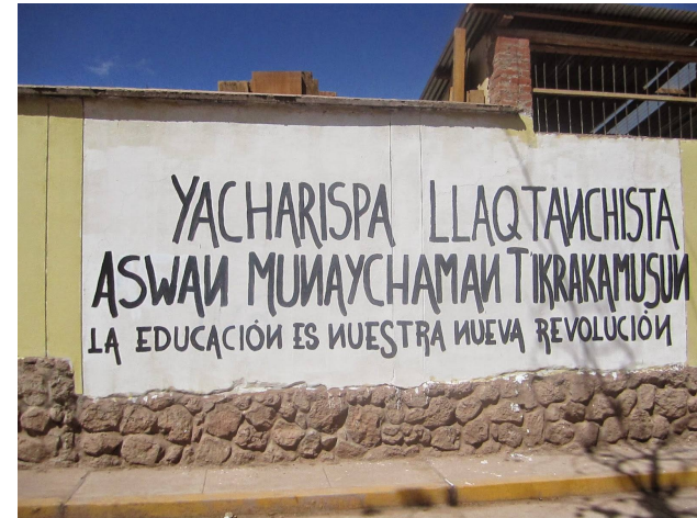
"Education is our new revolution" Street art in Quechua and Spanish, Cusco, Peru