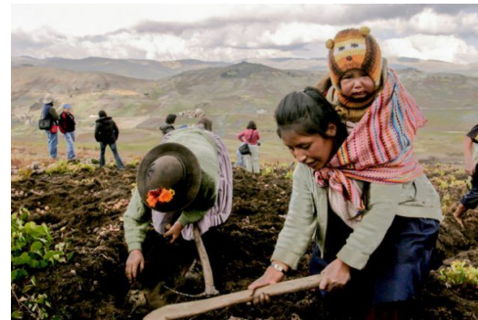
Farming in the birthplace of the potato, Andes mountains, Peru