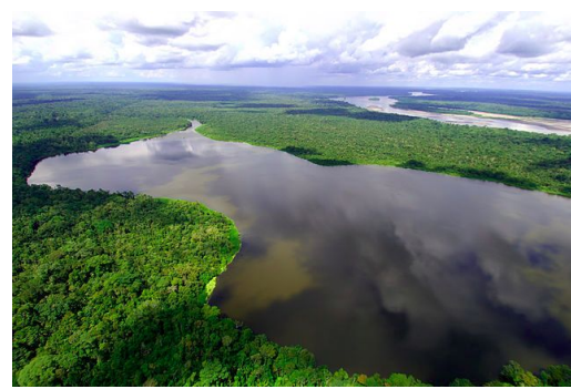
Amazon Rainforest, Ecuador