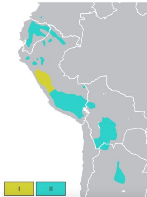
Modern extent of the Quechuan languages (color differentiation indicates the two primary subfamilies)