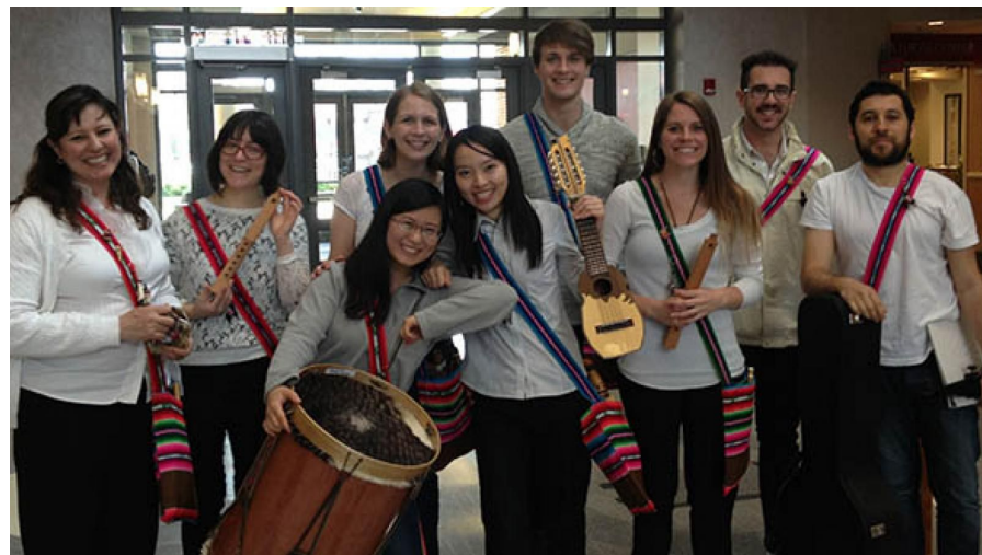
Andean Music Ensemble